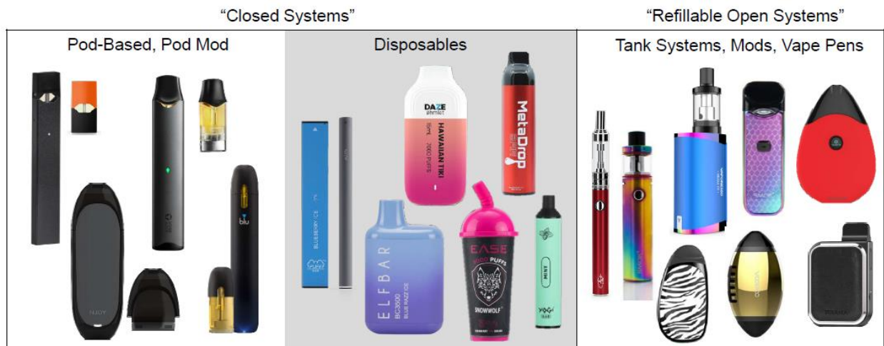
Sample of e-cigarette products. Images are not to scale.

The term “electronic cigarettes” covers a wide variety of products now on the market, from those that look like cigarettes, pens or USB drives to somewhat larger products like “personal vaporizers” and “tank systems.” Instead of burning tobacco, e-cigarettes most often use a battery-powered coil to turn a liquid solution into an aerosol that is inhaled by the user. The design of e-cigarette devices have changed since they have been introduced, becoming more sleek and more concealable.